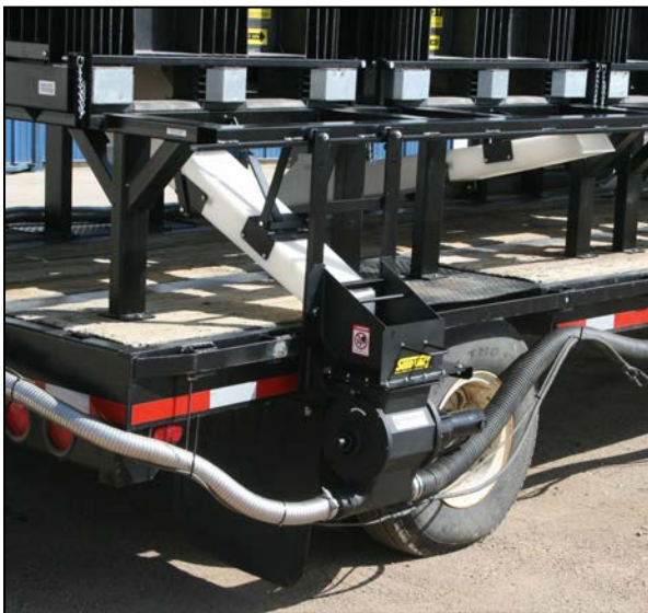
Figure 2: Rolling Bracket with BSS-box adapter

A close up of the rolling bracket with BSS-box adapter and air lock is shown in (Figure 2). Other rolling brackets are now available for different makes of air transfer systems.