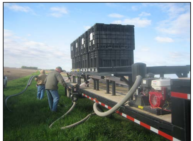
Figure 3: Semi flatbed with power unit

A close up of the rolling bracket with BSS-box adapter and air lock is shown in (Figure 2). Other rolling brackets are now available for different makes of air transfer systems.