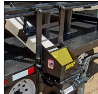
Figure 3: Rolling Bracket with bss-box adapter

A close up of the rolling bracket with BSS-box adapter and air lock is shown in Figure 3. Other brackets are now available for different makes of air transfer systems.