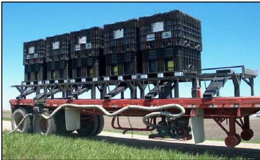
Figure 4: Semi flatbed with power unit below deck

The Air Lock (Figure 4) is rolled from one box to the next on a rail that connects all the stands together. Each stand is mounted with eight bolts to the trailer while the bulk seed boxes are held in place by a lock-down lever. There is no need to strap down each box!