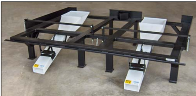
Figure 2: Double Stand (Model 219D) (Patent Pending)

The Double Stand - Model 219D (Figure 2) holds two bulk seed boxes. Each frame comes with two chutes. A rolling bracket for mounting an air lock is optional. Single frames (Model 219S) are also available.